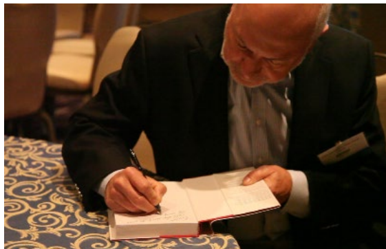
1204 x 772 horiz