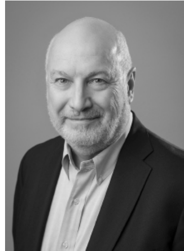
1000 x 1500 vert bw