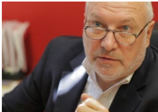
1200 x 762 horiz