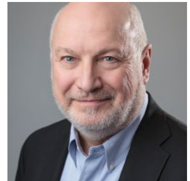
2000 x 2000 square