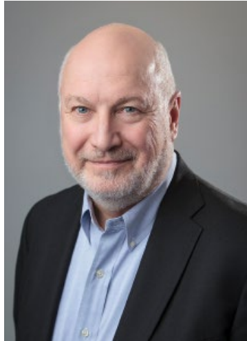
667 x 1000 vert